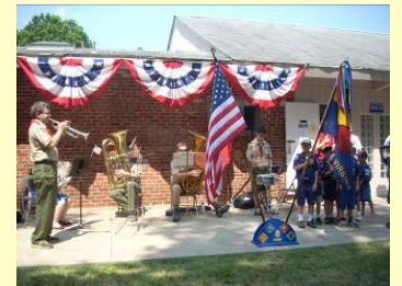
Troop Band at Waynewood 4 th of July Celebration

"For food, for raiment, For life, for opportunity, For friendship and fellowship, We thank thee, O Lord." Philmont Grace