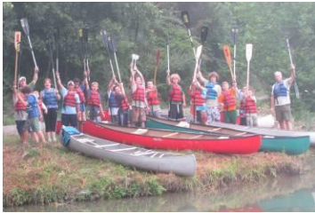
Summer Camp at Goshen's Camp Bowman