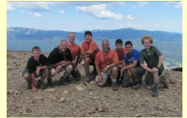
Mt Baldy, Philmont Scout Ranch Cimarron, NM