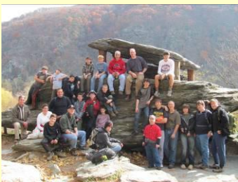
Troop Campout at Harpers Ferry, WV

The Troop 996 members are primarily boys from the Fort Hunt, Mt Vernon and Belle View areas and take an active part in their community. Troop meetings are held every Sunday @ 7:30pm at the Aldersgate United Methodist Church at the corner of Fort Hunt and Collingwood Roads. Troop 996 is a boy lead troop with adult advisors . We believe in the patrol method with each patrol having a Patrol Leader who works with the Senior Patrol Leader to lead and teach scout skills and instill scouting principles. There are many other troop leadership positions which contribute to the success of the troop each of which are designed to teach responsibility and instill a sense of accountability. Once every 3 months a Court of Honor is held during which time scouts are recognized for rank advancement and receive the awards and merit badges they have earned. Every scout is recognized for his individual accomplishments along with the accomplishments of their patrol and the entire Troop.